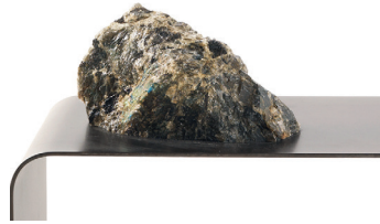
Natural raw Labradorite.