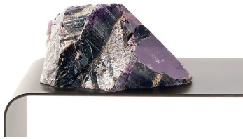
Natural raw Amethyst.