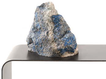
Natural Lapis Lazuli.